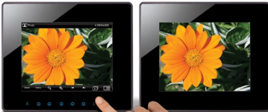
Photo mode touch controls activated.

> Hidden control buttons illuminate in blue when touched to indicate your selection and direct you to your photo, slideshow, music or video.