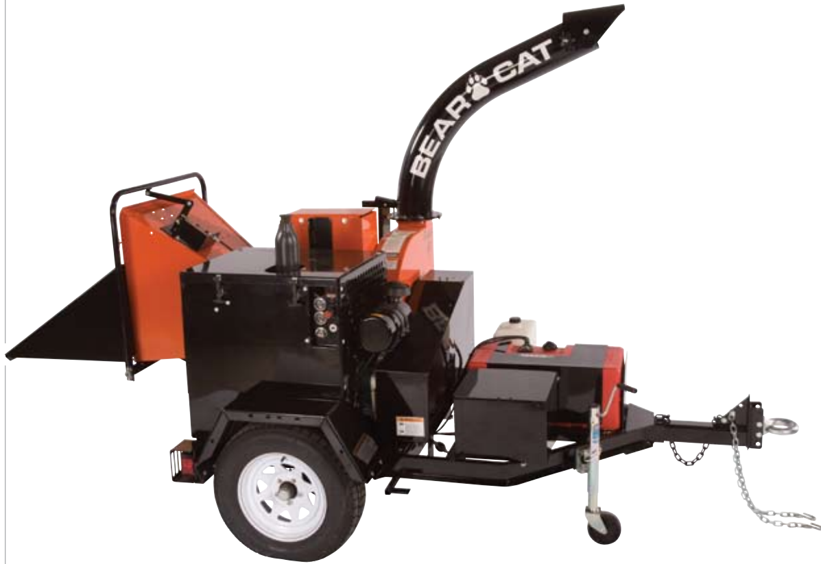
Model CH922DH (74950)