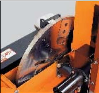
Four reversible chipper blades mounted on a dynamically balanced disc weigh in at 275 lbs. [125kg] Maintenance and service is quick and easy with a hinged disc cover.