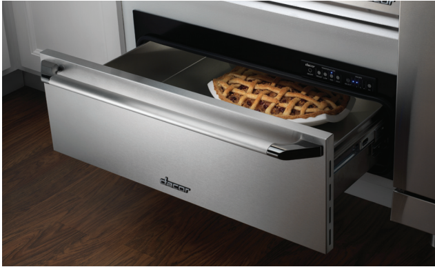
Epicure® 30" Warming Drawer