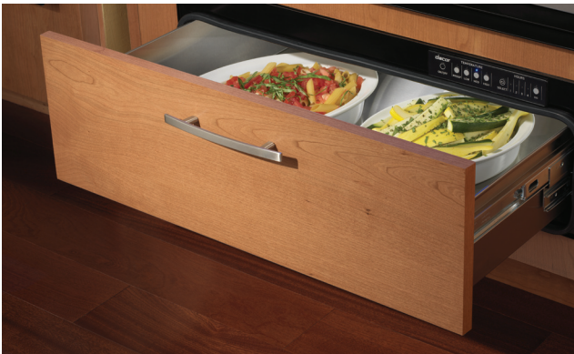
Integrated 30" Warming Drawer