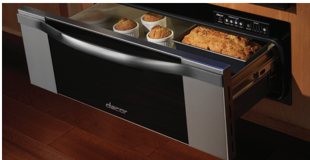
Millennia 30" Vertical Warming Drawer