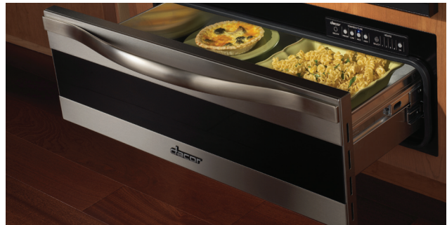
Millennia 30" Horizontal Warming Drawer