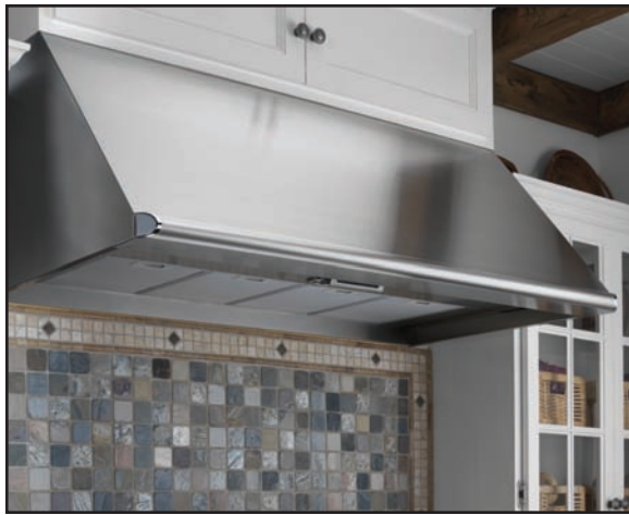
Epicure® 48" x 12"