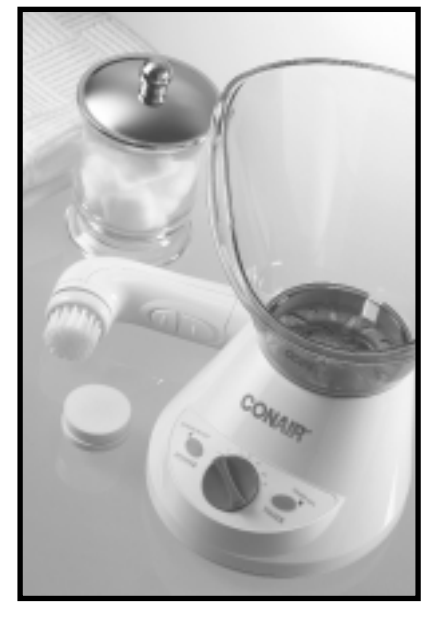
Instruction Booklet Model MDF2