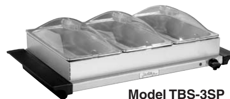
Model TBS-3SP (with clear lids)

Models TBS-5S, TBS-4S, TBS-3, TBS-3S, TBS-3SP, TBS-2S