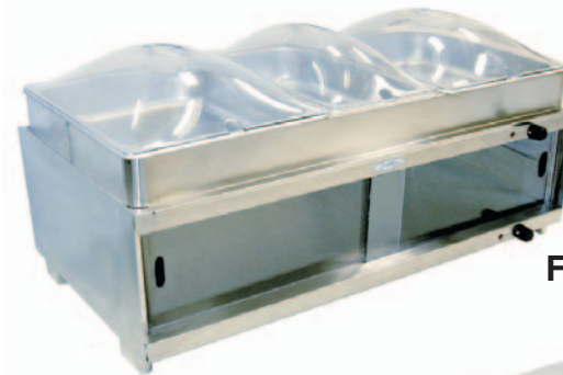
Model MLB-CSLP Warming Cabinet with Family Size Buffet Server