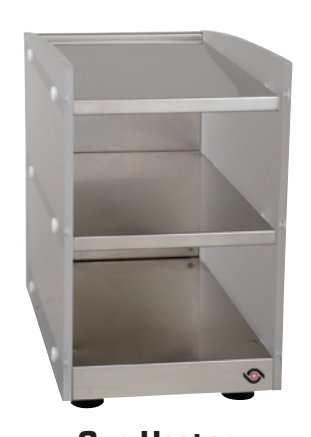
Cup Heater Dimensions: 15.4"H x 10"W x 15"D (39.0 cm H x 25.4 cm W x 38.1 cm D)