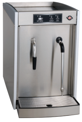
Steamer Dimensions: 15.4"H x 9.7"W x 17.7"D (39.0 cm H x 24.6 cm W x 45.0 cm D)