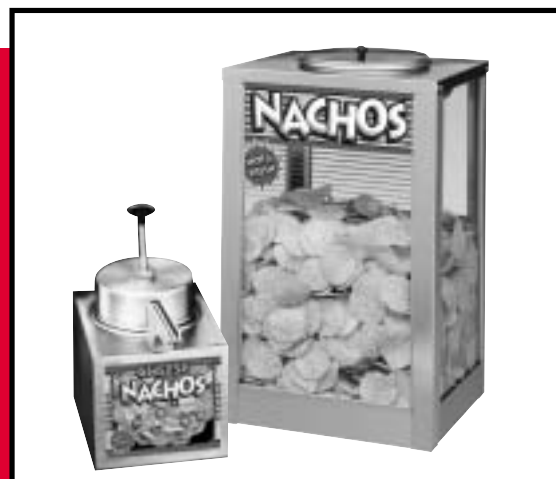
Nacho Cheese Pump with Nacho Cabinet