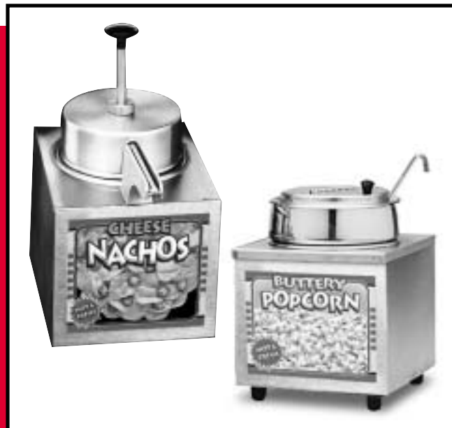
Nacho Cheese Pump and Hot Butter Warmer