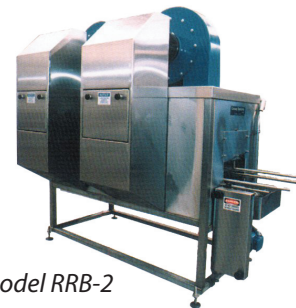
Dryer Model RRB-2