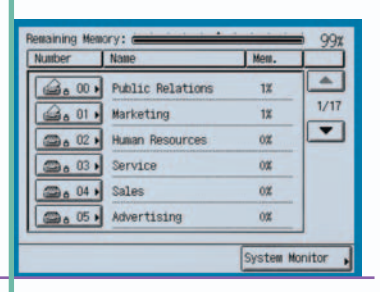
Mail Box Main Menu