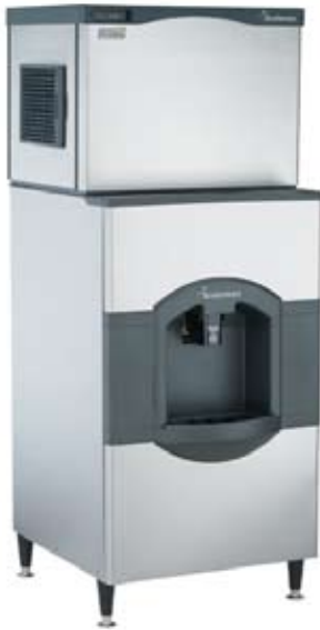
HD30 shown with a Prodigy C0330A cuber