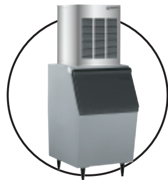
MFE400 on HTB555

* 3-phase available. **Add an additional 6" for leg height on all items. ***KWH and water based on 100 lbs. of ice. The above specifications based on a single phase model. See individual spec sheet for 3-phase models. See back page for appropriate bin types.