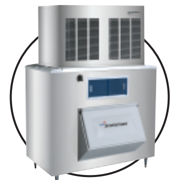
NME1854 on BH1600