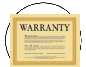
Unprecedented 3-Year Parts & Labor Warranty