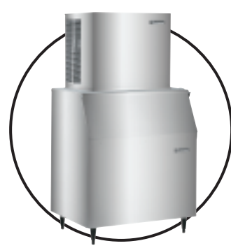
FME1504 on BH801