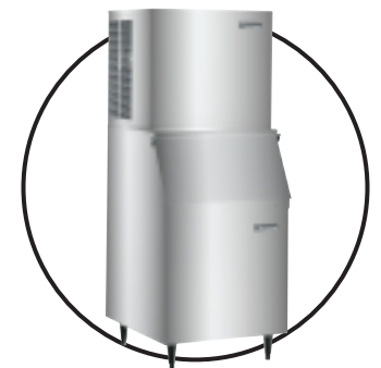
NME1254 on BH550