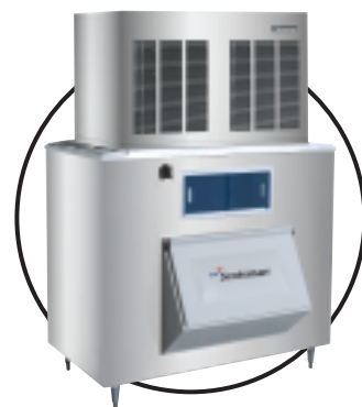
FME3004RLS on BH1600