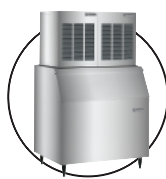
2 FME1204s on BH900