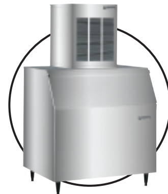
NME654RLS on BH900