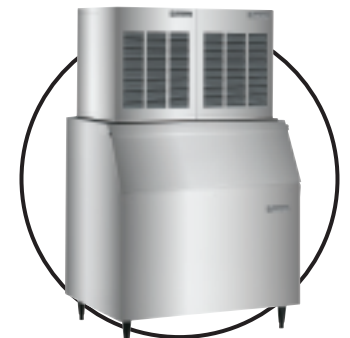
2 NME954s on BH900

* 3-Phase available. ** Add an additional 6" for leg height on all bins. ***KWH and water based on 100 lbs. of ice. The above specifications based on a single phase model. See individual spec sheets for 3 phase models. R-22 available upon request. See back page for appropriate bin tops.