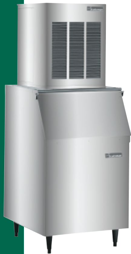
FME21 on BH550

Scotsman flake ice is small, hard bits of ice, while our nugget form is compacted flake ice that is slow-melting and easy to chew.