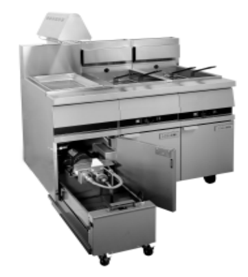
Model Filt II-14W shown banked to (2) 14" fryers

180 North Anets Drive • Northbrook, Illinois 60062 • 847-272-0770 • Fax 847-272-1943 For ANETS Factory Warranty Service • 800-837-2638