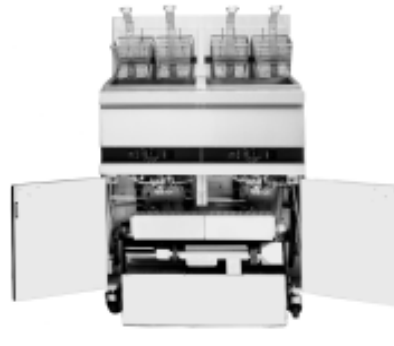
Model FM-14 Filter Mate shown under the base system of (2) 14" fryers