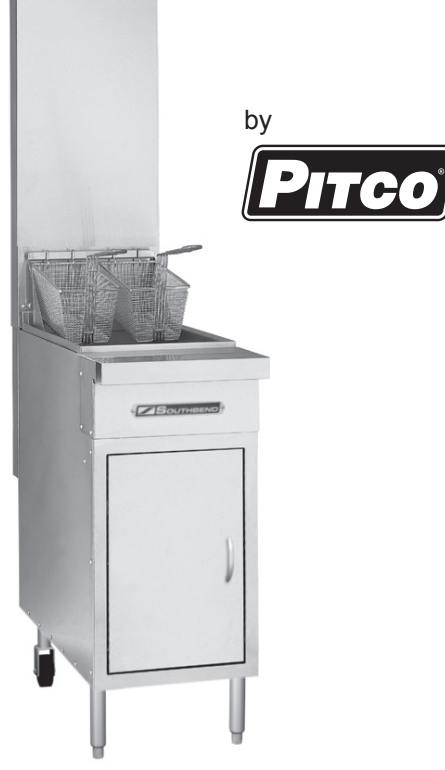
(shown with optional flue)