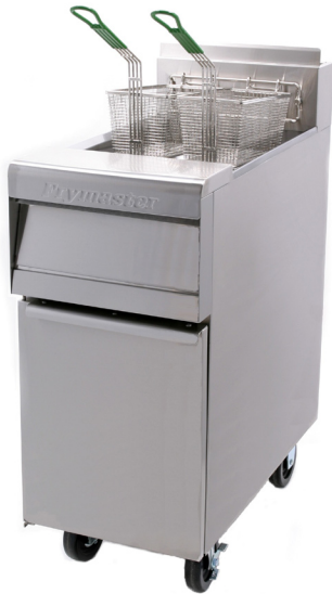
Shown with optional casters