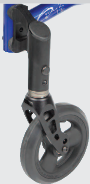
Redesigned Caster Housing