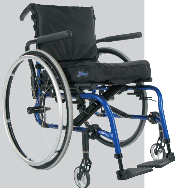
Quickie 2 Lite Fixed Front