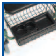
Basket Organizer Model 7878