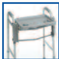
Folding Flip Tray-Open Model 7850