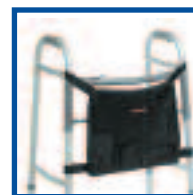
Front Pouch Model 7741