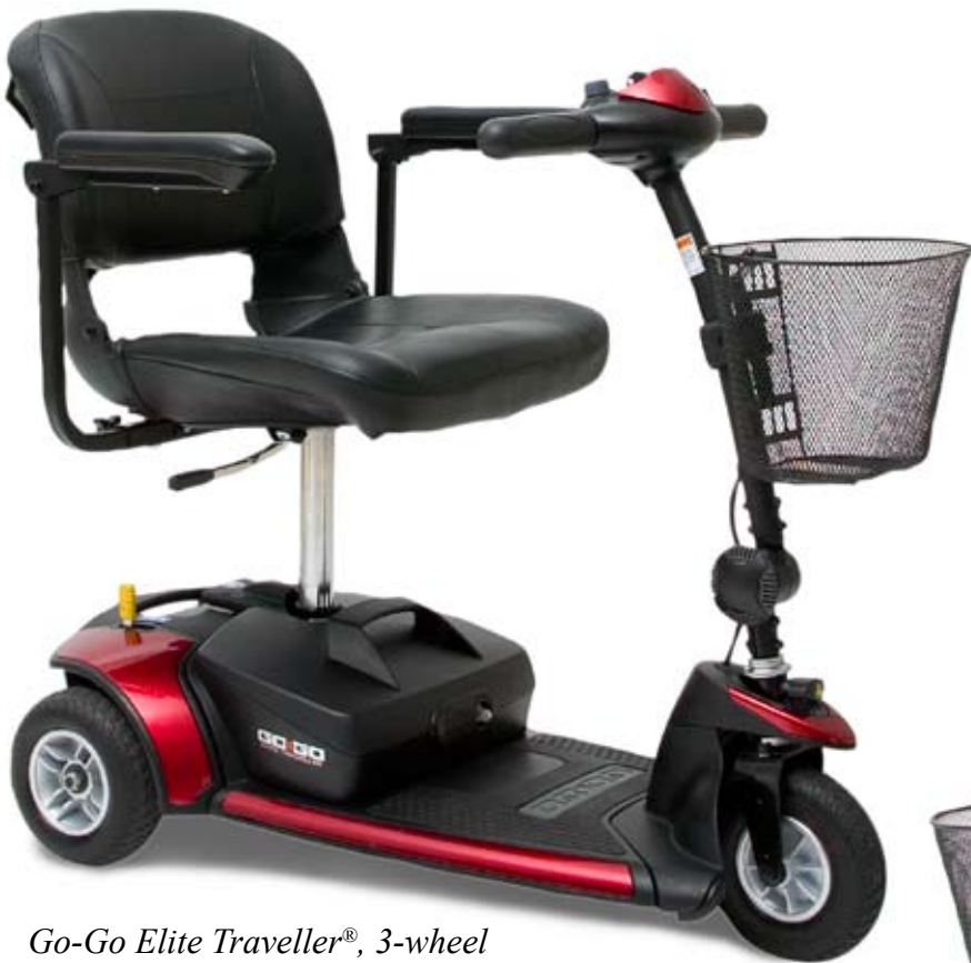
Go-Go Elite Traveller® , 3-wheel

The Go-Go Elite Traveller®'s compact design allows it to easily maneuver in tight spaces while providing stable outdoor performance. Take the guesswork out of travel with simple, one hand Feather-touch disassembly. Go where you want to go, easily, with the Go-Go Elite Traveller.