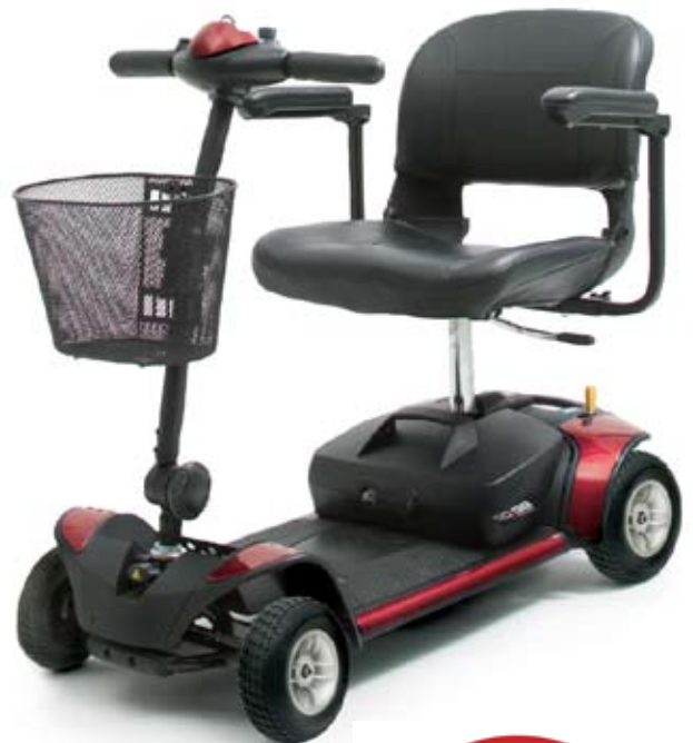
Go-Go Elite Traveller® , 4-wheel