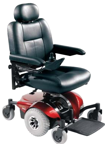
Pronto® M41™ with Semi-Recline Van Seat