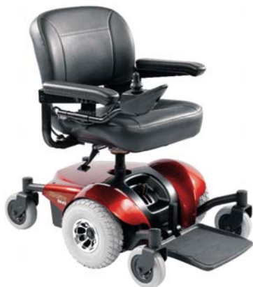
Pronto® M41™ with Fold-Down Seat

The Invacare® Pronto® M41™ is the latest offering in the sleek and versatile Pronto® series of power wheelchairs. The M41™ features the latest technology in electronics and in-line motors. This combination provides increased efficiency and battery range, as well as an increased top speed. The M41 also features a center-wheel drive platform, simplified SureStep®, and six wheels on the ground providing stability and maneuverability similar to other Pronto® models. All of these features are packed into a simple, clean-looking, and easy-to-service compact frame that provides mobility with style for people on the go!