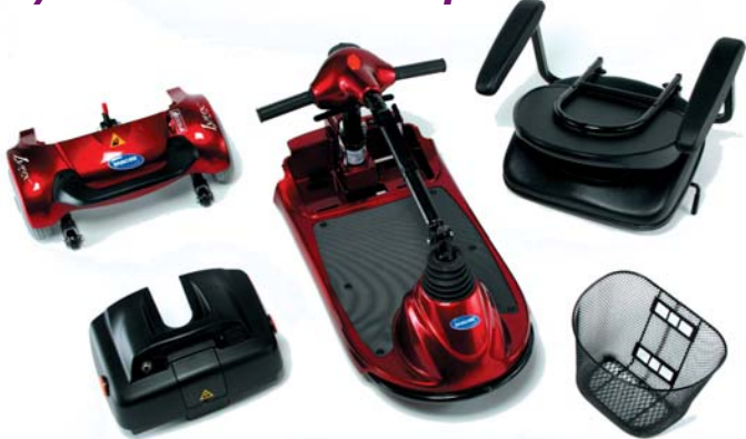
Disassembles for Easy Transport