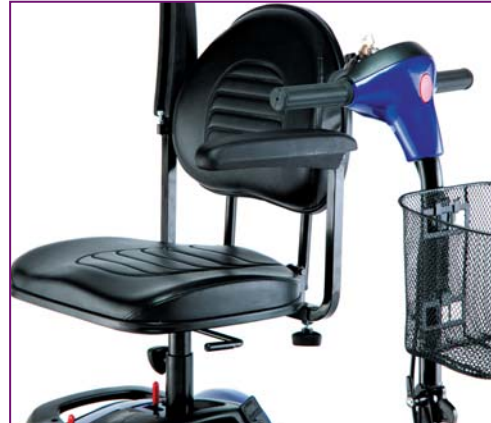
360° Rotating Swivel Chair

*Travel range will vary depending on user weight, speed, battery charge and terrain.