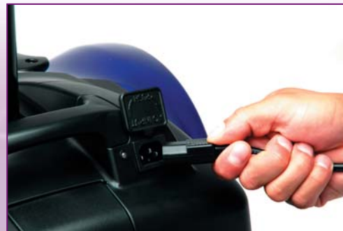
On/Off Chair Battery Charging