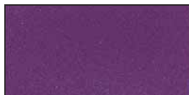
120P Grape Madness