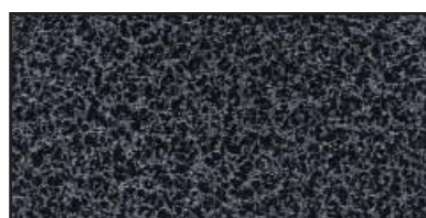
71P Silver Vein