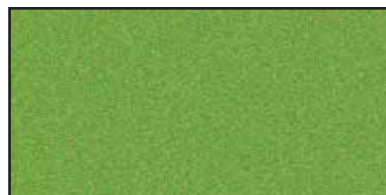
127P Grasshopper Green