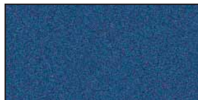
122P Cosmic Blue