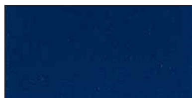
105P Midnight Blue