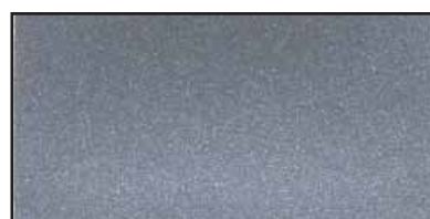
60P Silver Metallic