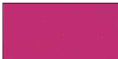
119P Bubblegum Pink