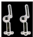
Dual Coin Drop