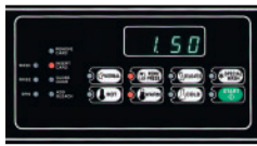
Fully programmable NetMaster™ control

Our advanced NetMaster™ control makes it easy for customers to locate the vend price, cycle selections, cycle status, and remaining cycle time. Customers will appreciate knowing the status of their laundry and the ability to be more efficient with their time.