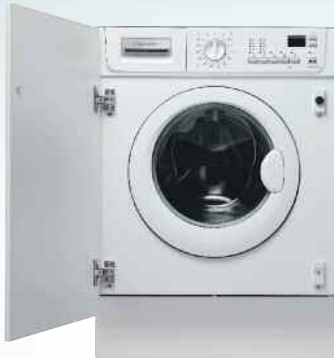
EWG12450W Fully integrated 1200rpm spin electronic washing machine