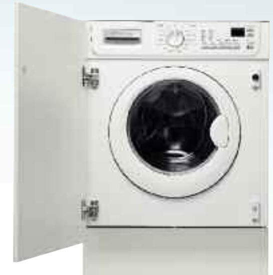
EWX12550W Fully integrated 1200rpm spin electronic washer dryer