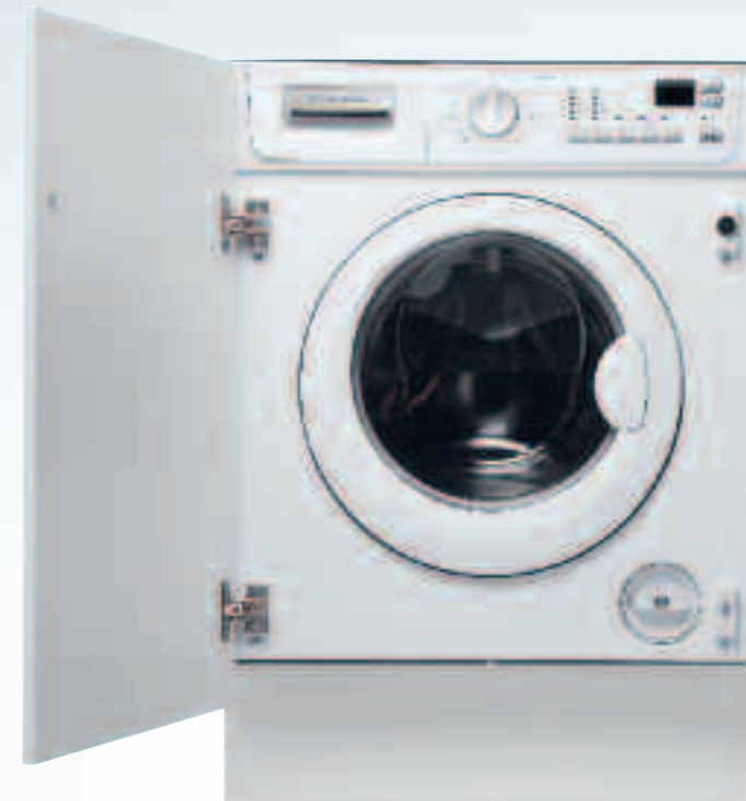
EWG14440W Fully integrated 1400rpm spin electronic washing machine