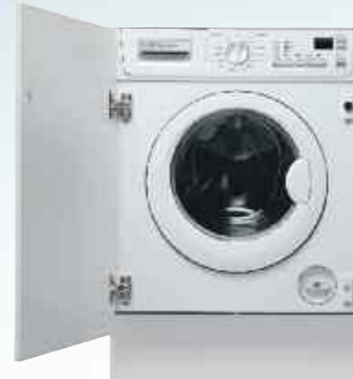
EWX14450W Fully integrated 1400rpm spin electronic washer dryer