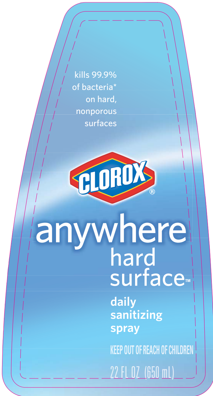
Artcode 12877.107 (tc)

22oz Bottle Front and Back Panels shown at approximately 115% of actual size