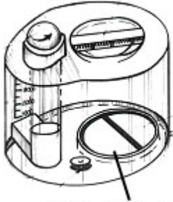
Water Filling Cap