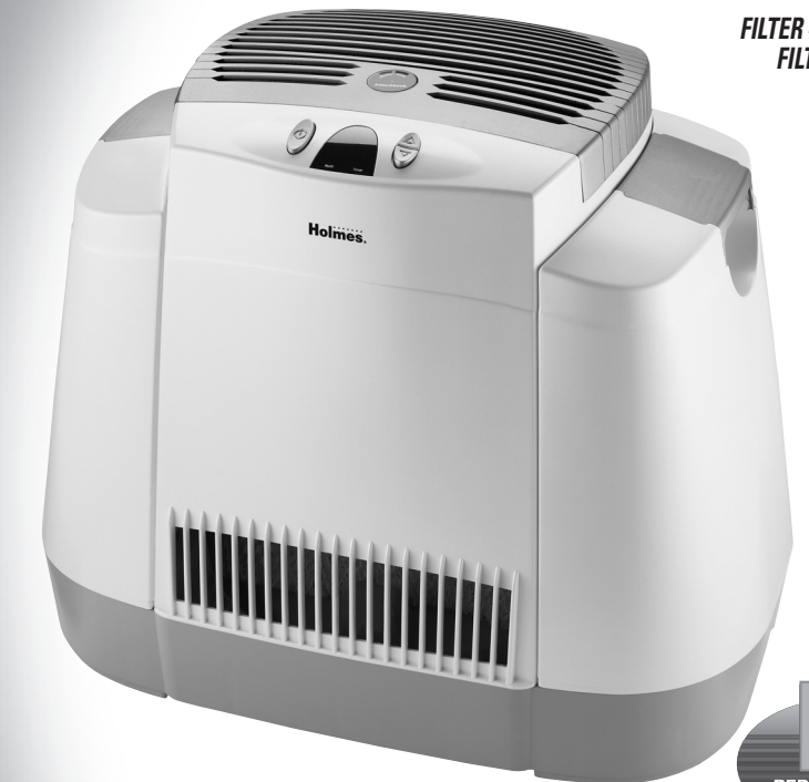
FILTER #: HWF75/HF221 FILTER TYPE: WICK

INFO HOT-LINE: If, after reading this owner's guide you have any questions or comments, please call 1-800-546-5637 and a Customer Service Representative will be happy to assist you.