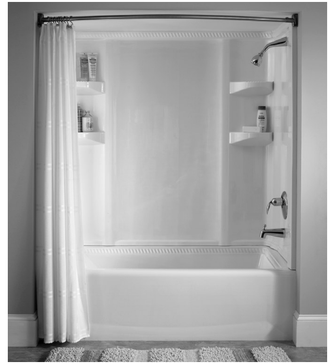
Rope Twist Bath Walls with Rope Twist Bathing Pool Shown. Specify Walls Separately.

For color/finish availability and other faucet choices, please see the Product Selector and Pricing Guide.