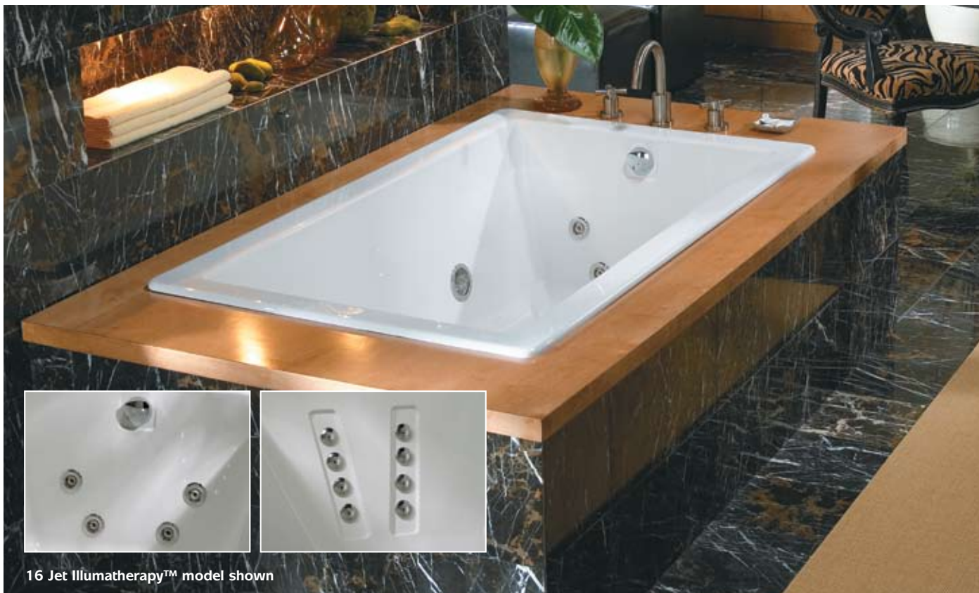
16 Jet Illumatherapy™ model shown

If you enjoy soaking in a warm, soothing tub surrounded by gently moving water, or if you prefer an invigorating foot and back massage, the Elara™ tub is right for you.