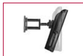
Tilt allows adjustment of +15/-5°