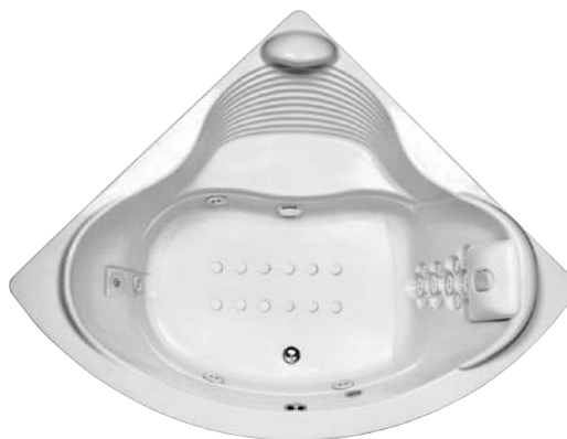
*Not available without Fast-Fill Waterfall Spout.