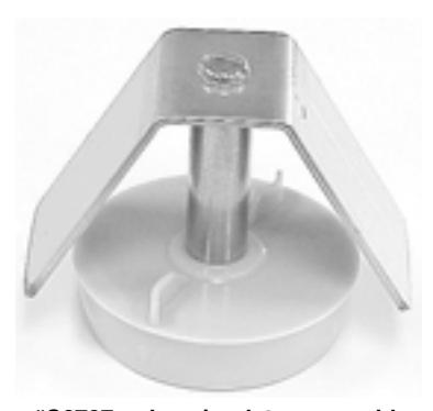
#S6737 pulpy circulator assembly

Circulator for pulpy products #S6737, including orange juice from concentrate, fresh squeezed lemonade, and any pulp based beverage.