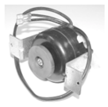
Spray Drive Motor p/n A1753