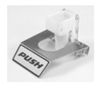
No Cup Contact p/n S6469