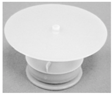
#A1620 foamy circulator

Circulator for foamy products #A1620, including ice tea and coffee from concentrate and some juice.