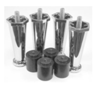
Leg extension kit p/n S4056