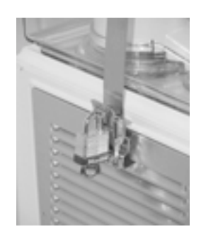
Locking Kit p/n A3035 (JT-20), p/n A3036 (JT-30)