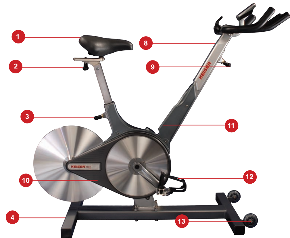
1 Saddle 2 Forward/Backward Seat Adjustment T-Handle 3 Up/Down Seat Adjustment T-Handle 4 Sturdy Base 5 Multi-Function Computer System 6 Resistance Shifter 7 Dual Placement Handlebars 8 Sweat Guard 9 Up/Down Handlebar Adjustment T-Handle 10 Belt Cover 11 Water Bottle Holder 12 Shimano™ Combo Pedals 13 Easy Transport Wheels