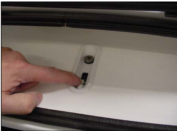
Power breaker in glove box