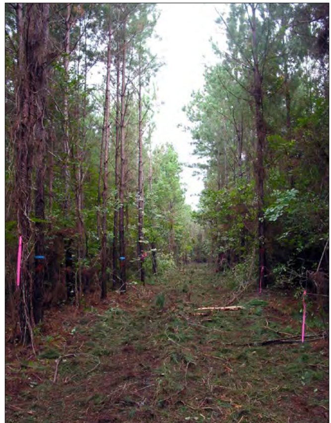
Figure 2. Compass lines marking access corridor.

If no "good" tree is present, a less desirable tree (forked, crooked, small, etc.) may be used in the square rather than leaving the area empty. Again, choose the best tree available in each given square. After selecting the tree you plan to leave, mark it with paint using a large slash at eye level and at ground level on the stump. Consider logging direction, and make eye level marks facing the expected cutting direction.