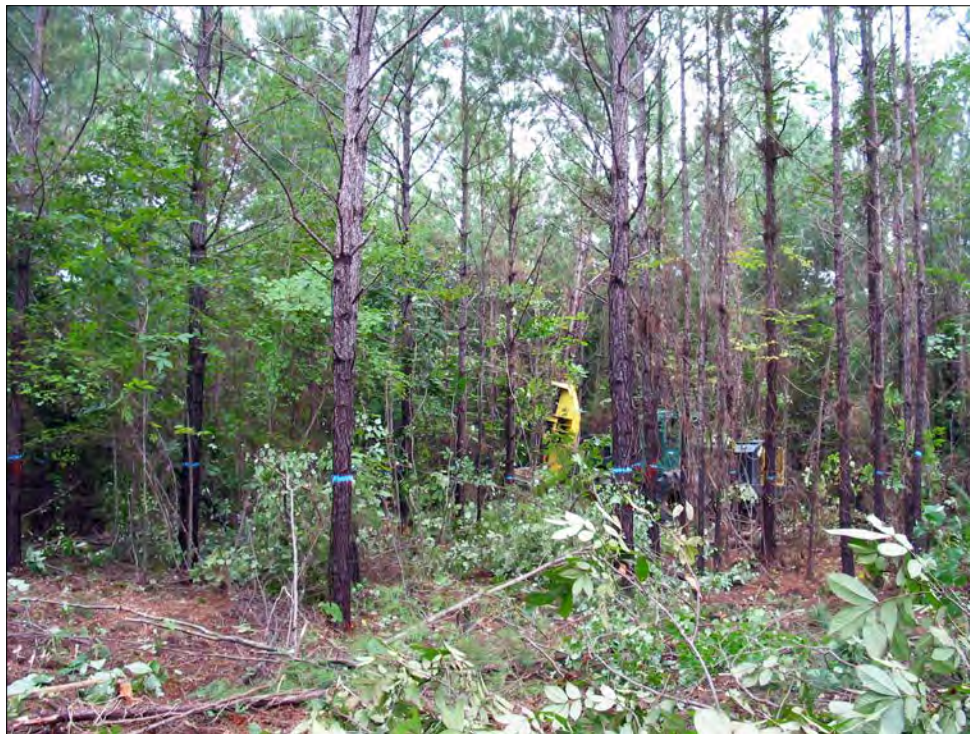
Figure 6. Completed thin.