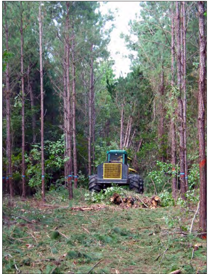
Figure 5. Unmarked trees being removed.

Leave tree marking is not difficult, but, upon completion, you should check your work for large-scale mistakes. Take time to walk back through the stand and observe the spacing of leave trees. The paint marks let you see what the stand will look like after it has been thinned. Now is the time to catch any major errors. Once the stand is thinned, any unchecked mistakes may be irreversible. The next time you thin, you will need to use a different color paint to differentiate leave trees from those to be cut.