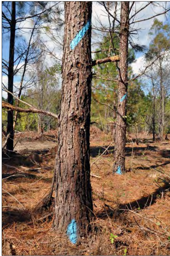
Figure 4. Marked trees.