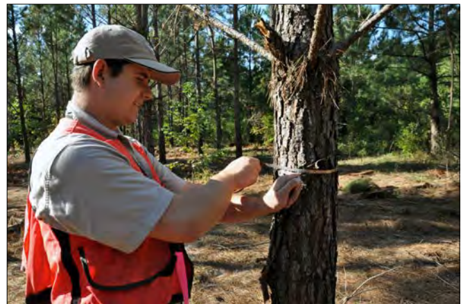
Figure 1. DBH measurement.

Tree diameter must be used to determine proper tree spacing. Tree diameter is measured at 4½ feet above the ground. Measurements at this height are called diameter at breast height, or DBH. DBH can be measured with a steel diameter tape or a Biltmore stick. The Biltmore stick is quick and easy to use but is not as accurate or consistent as a diameter tape. For information on how to construct or obtain a Biltmore stick and on proper DBH measurement techniques, consult your Extension forestry specialist, or read Extension Publication 1473 4-H Project No. 7: Measuring Standing Sawtimber .