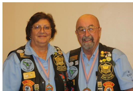
2016 Couple of the Year