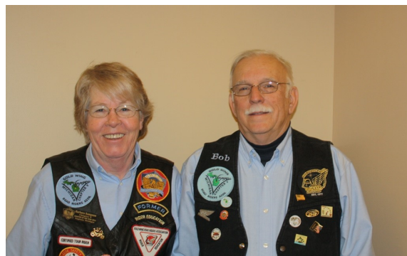
Chapter Directors for Chapter V