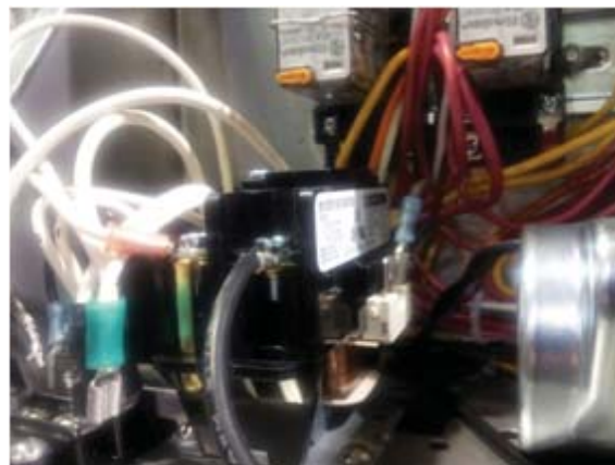
Wash motor contactor to the left of the cam timer motor