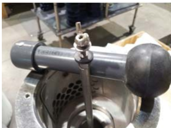
ET (gravity) drain ball, note rubber washer on push rod