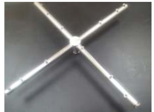
Cross arm for light glassware (081-6212)