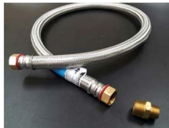
OPTIONAL 48" hot water inlet flex hose and adapter (088-1068)