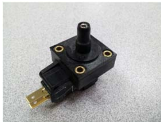
Optional chemical alarm pressure switch