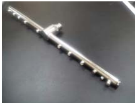
Standard ET-AF spray arm (081-6208)