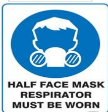
HALF FACE MASK RESPIRATOR MUST BE WORN