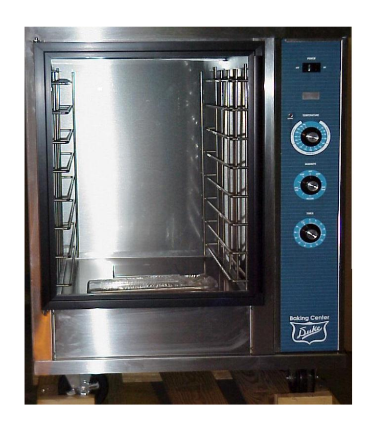
Installation, Operation, Parts & Service Manual