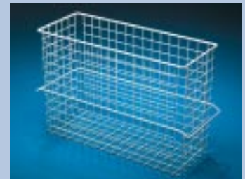
Products and specifications subject to change.

One epoxy-coated wire basket comes with all models. Extra baskets are available. For 5, 7 and 9 cu. ft. models (ST05G, ST07G and ST09G), order basket model 216657300. For 13, 15 and 20 cu. ft. models (ST13G, ST15G and ST20G), order basket model 216506100.