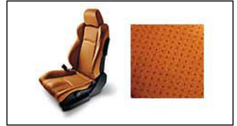
Alezan Orange Leather