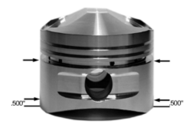
MEASURE CLEARANCED PISTONS HERE

Piston skirt----4.1230 Clearance----+0.0025 Finished bore--4.1255