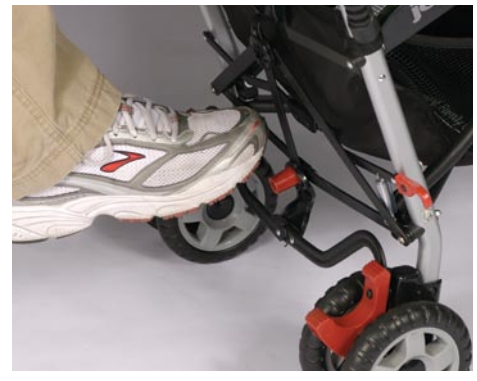
Figure 2 Figure 3