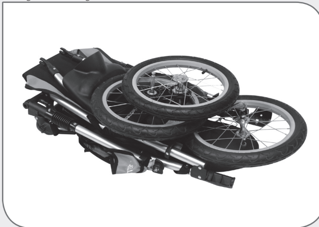
Storage and folding

Pull the back of the seats forward. It will be easier to fold if the seats are not in the recline position. Remove locking pins from side latches on the stroller frame (Double Models have 2 locking pins). Release the two latches from the frame. The stroller may automatically begin to fold, the front wheel will fold under frame and the handle will fold backwards. For a more compact fold remove front and rear wheels