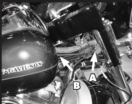
Figure 1.3 - Stock Harness and Amplifier's Harnesses Passing From Fairing To Just In Front Of Tank (Arrow A). Cable Tying the 2 Amp Harnesses To The Main Bike Harness Just In Front Of The Tank (Arrow B) Allows The Amp Harnesses To Go Up Towards The Tank's Chrome Console Easier And Makes For a Cleaner Install.

Step #1: The power/ground harness and supplied long rear harness for Ultras will pass together under the inner fairing where the main wire harness passes through on the brake side of the bike. Loosen the tank's "chrome console" and run wires up and over the gas tank, but under the tank's chrome console. There is a provision on the front of the tank console for wires to pass. NOTE: Although not necessary, the power and rear harnesses can go under the gas tank if you choose to remove and re-install the tank.