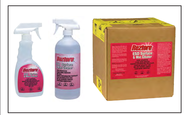
Figure 1. Reztore™ Surface & Mat Cleaner: 16 ounce (500 ml) spray bottle 1 quart (1 litre) spray bottle 2.5 Gallon (10 litre) Bag-in-Box