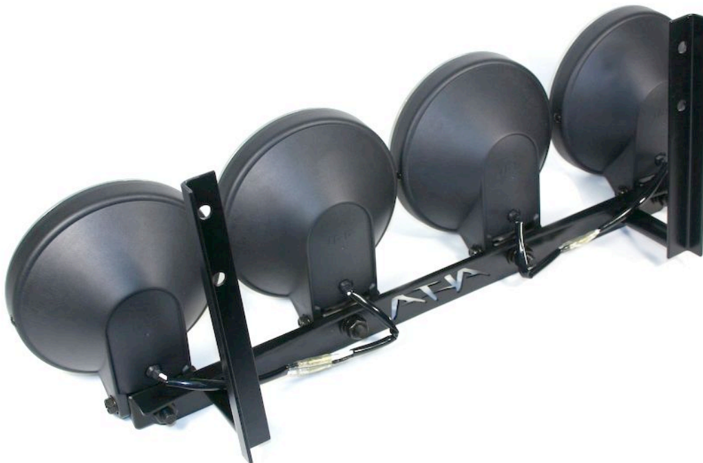
Diagram shows completely assembled ALTA light bar from behind