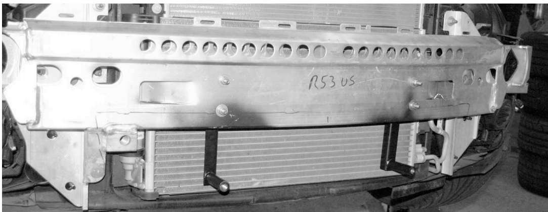
Bumper beam and struts in place and ready for bumper skin