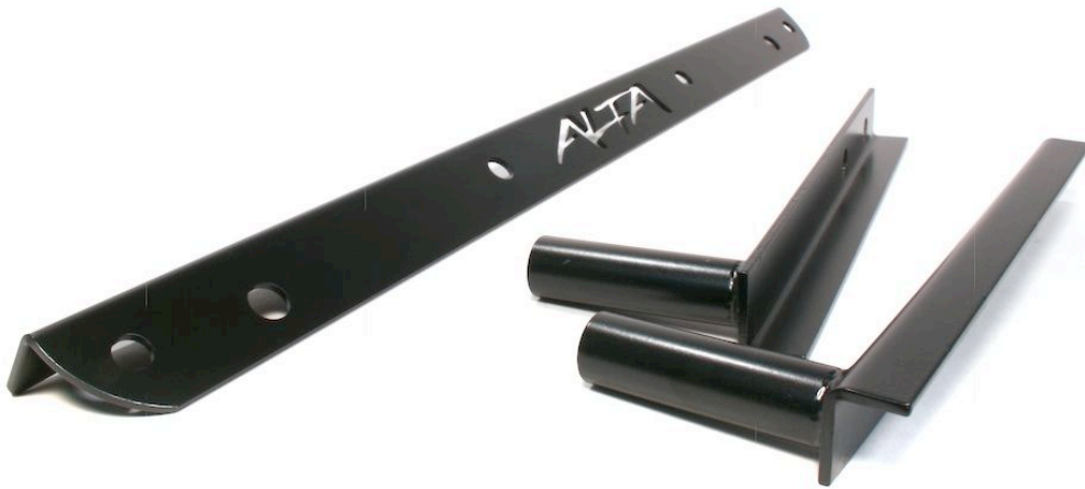
Horizontal Mounting Beam, and Struts shown above