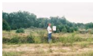
Picture 21 – Category 2 cut by ARTS (taken level with top of step terrain)