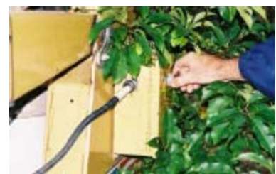
Picture 31 – Resetting emergency stop button