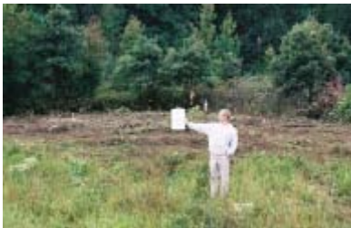
Picture 29 – Cut category 3 vegetation