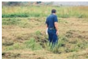
Picture 15 – Large crater