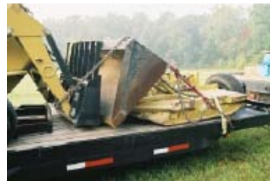
Picture 13- Stacked tools

The system is transportable by truck, rail, vessel and C-130 aircraft (or larger aircrafts). The height of the system must be slightly lowered (by removing the antenna) for transport by C-130 and this should be documented in an Air Force Air Certification. If desired, and depending on the amount and type of attachments and support package, a 20-foot or a maximum 40-foot container would be sufficient for vessel transport. The system itself is highly mobile and maneuverable, even by remote control. The remote control is simple to operate, but there is a two-mile line of sight restriction with the remote control antenna. The system only has a 14-inch ground clearance, so large objects would likely impede its mobility. The system is track only, but the tracks are hard Kevlar reinforced rubber, allowing travel on macadam roads without damaging the road. Longer distances are of course limited by the remote control and power requirements, but the system is capable of being driven manually even though there is no driver seat.