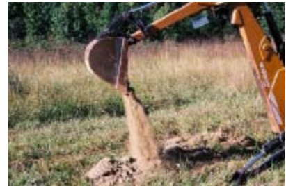
Picture 42 – Backhoe dumping dirt