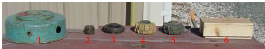
Picture 32 - Demonstration targets