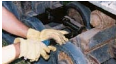
Picture 51 – Adjusting track length