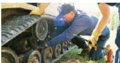
Picture 52 – Releasing rear axle tension