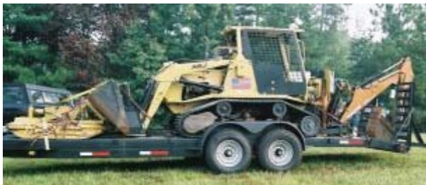
Picture 12- ARTS with tools on trailer

The system was transported on a 24ft trailer that was towed by a commercial Ford F-450 heavy-duty truck to the NVESD/CM test site. The ARTS with all of its tools loaded on the trailer is shown below in picture 12. For better utilization of trailer space and limiting the number of support vehicles required, the tools were stacked upon one another, see picture 13 below. The system does not have any transportation restrictions and does not require highway permits to be transported over land.