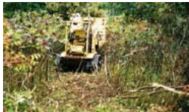
Picture 27 - ARTS cutting dense sumac brush