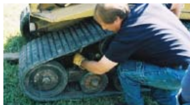
Picture 49 – Removing track locking bolts