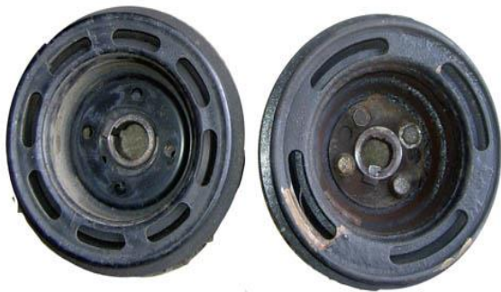
Long Nose Crank