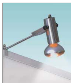
Arm Spot Light