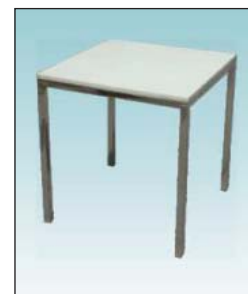
Square Table W H D 70cm 70cm 70cm