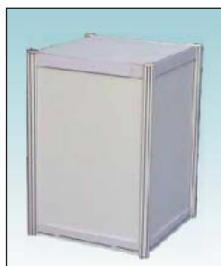
Podium W H D 50cm 70cm 50cm