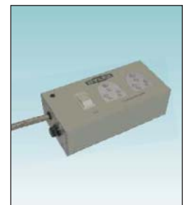
Socket Out Let